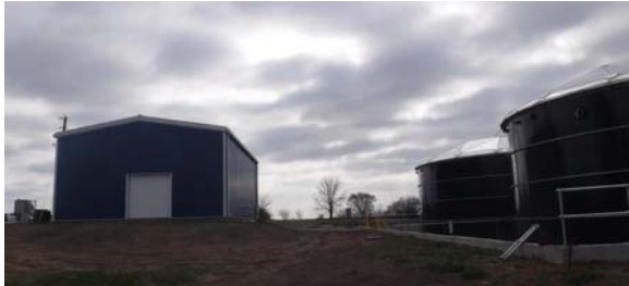
Figure 1. Photograph of the Missouri City Landfill 250,000-gallon storage tanks and the water treatment plant building.

the water treatment plant will occur in November or December 2018. A photograph of the water treatment plant building and associated storage tanks is provided in Figure 1.