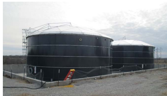
Figure 1. Photograph of the Missouri City Landfill 250,000-gallon storage tanks and secondary containment.

was watertight. A photo of the storage tanks and associated secondary containment is provided as Figure 1.