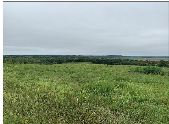
Photograph 1: Top of the Missouri City Landfill looking northeast on September 8, 2020.